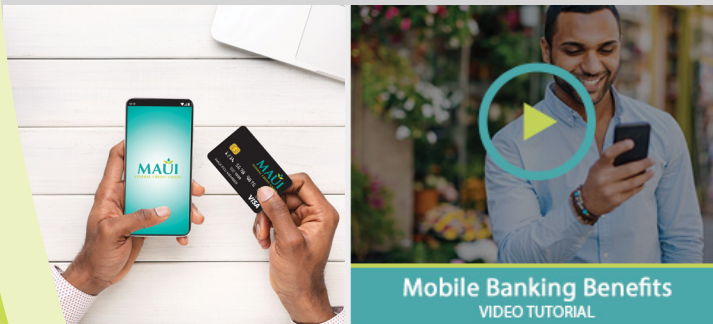
Mobile Banking Benefits VIDEO TUTORIAL

NEED ASSISTANCE AFTER HOURS? FREE ONLINE TUTORIALS CLICK-THRU DEMOS AVAILABLE 24/7